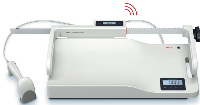
Image contains optional digital measuring rod seca 234 and barcode scanner from a third-party vendor.