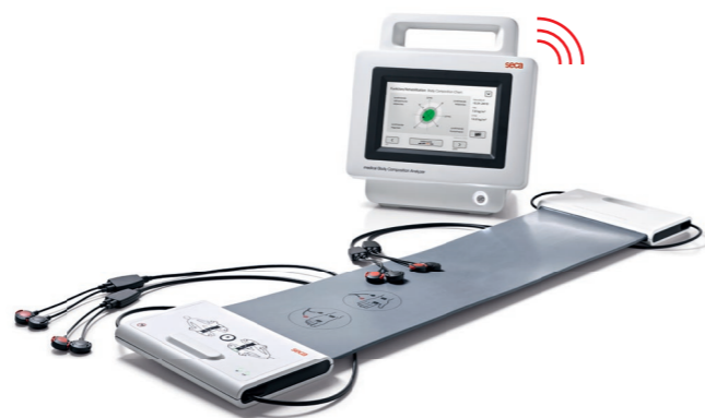
seca mBCA 525